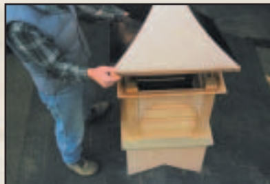
Secure the cupola roof.