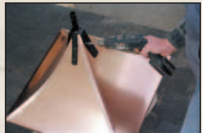
Attach weathervane. Paint or stain the cupola.