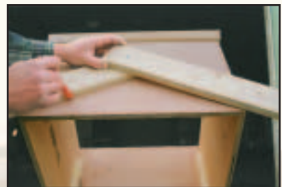
Use the marked pieces as a template for notching the cupola base so that it fits the roof.