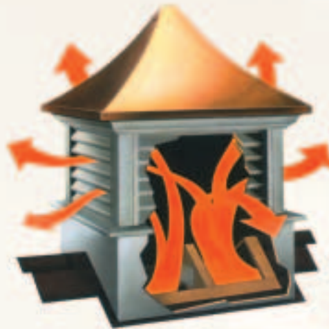
Designed for natural ventilation to reduce damaging hot air and condensation

Ventilate warm moist air up and out of the attic through the generous louver panels and stop worrying about wood rot, mildew, peeling paint, and musty odors. Stephenson Cupolas even help prevent ice dams in rain gutters by evacuating under-roof moisture. Install and forget—no ventilator fans to wear out, no electrical wiring to install and maintain.