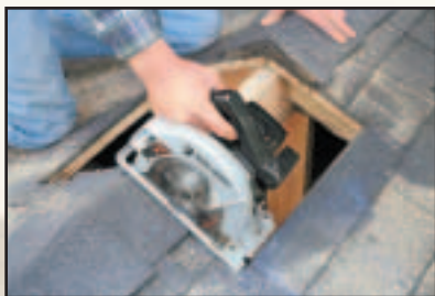
Saw out the roof opening for the cupola, being careful not to cut rafters or the roof ridge. Screening can be stapled over the opening to keep out insects.

Before installing the cupola, protect interior and exterior wood surfaces with an oil-base sealer and topcoat.