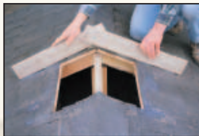
Lay two pieces of scrap wood at the roof's peak and mark them where they cross.