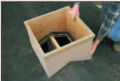
Secure the base to the roof with non-ferrous nails driven at an angle.